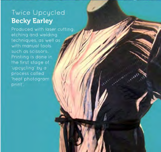
Twice Upcycled Becky Earley Produced with laser cutting, etching and welding techniques, as well as with manual tools such as scissors. Printing is done in the first stage of 'upcycling' by a process called 'heat photogram print'.