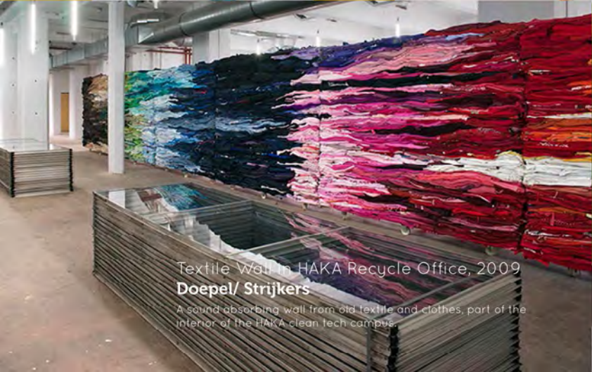
Textile Wall in HAKA Recycle Office, 2009 Doepel/ Strijkers A sound absorbing wall from old textile and clothes, part of the interior of the HAKA clean tech campus.