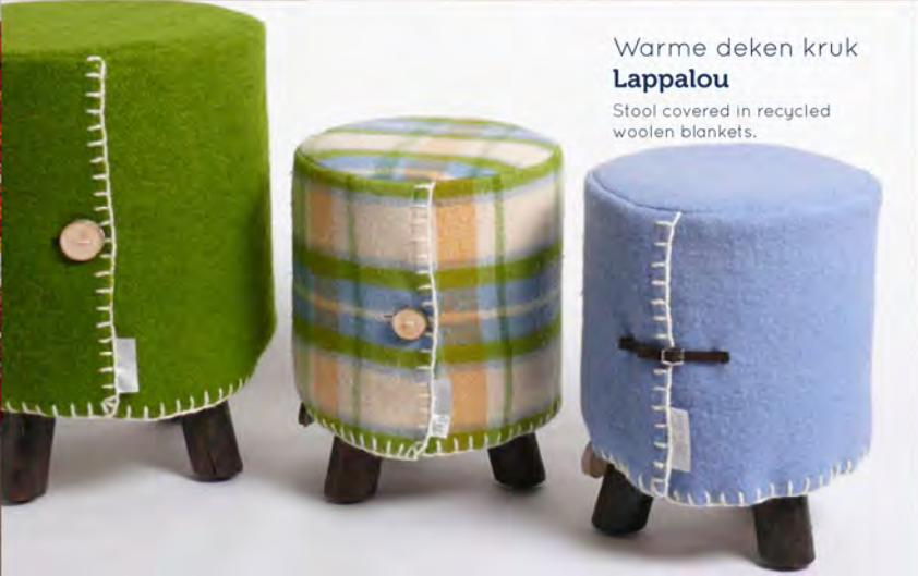
Warme deken kruk Lappalou Stool covered in recycled woolen blankets.