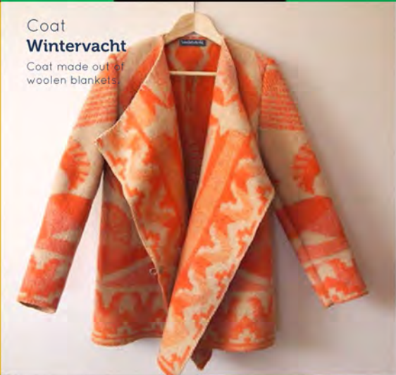
Coat Wintervacht Coat made out of woolen blankets.