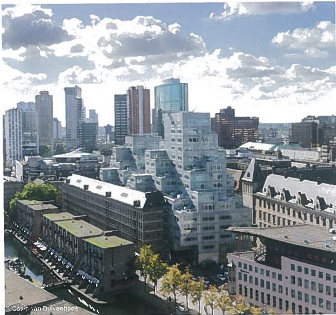
Ossip van Duivenbode