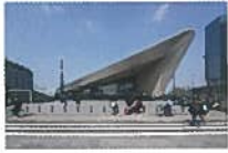
Ossip van Duivenbode