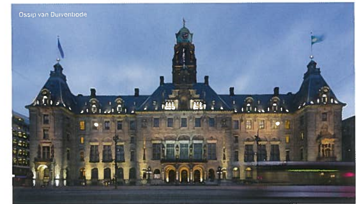
Ossip van Duivenbode

Acclaimed and denounced in equal measure by architecture critics all over the world, the square was built on the roof of a parking garage. Various materials were used in its construction, including an epoxy floor, steel and natural stone plates, and wooden flooring. The bent red lamp posts are evocative echoes of dockside cranes.