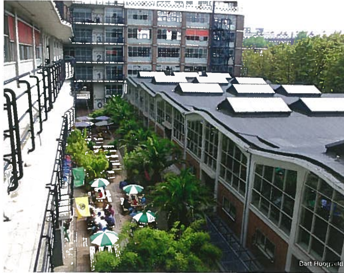
Barf Hoop, 18

This national monument is a typical symbol of post-war reconstruction. The huge structure, 220 by 85 metres in size, was built in the early 1950s. There are offices and shops distributed across various levels, with a 1.5 kilometre 'road' through them. It is a leading meeting place for entrepreneurs.