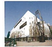
Maarten van Houten

The Euromast observation tower was constructed to mark the Floriade gardening extravaganza. The tower is made from reinforced concrete. The Euromast lift takes just 30 seconds to whisk visitors to a height of 100 metres, where there is an observation deck and brasserie restaurant. The Euroscope revolving lift takes people up to 185 metres.