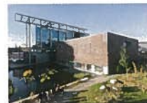
Ossip van Duivenbode

This striking building houses a museum of architecture, fashion, design and e-culture. The building consists of several elements which form a harmonic ensemble with the surrounding environment. By lifting the archive of the museum, an arcade was created beneath it.