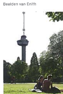
Beelden van Enith

DID YOU KNOW? The ss Rotterdam is permanently moored at the tip of the Katendrecht peninsula. The general areas on the ship, including the restaurants, are open to the public.